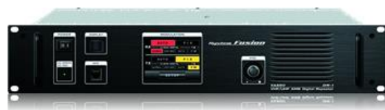
LC Echo 440 Repeater Yaesu DR-1X 442.925 MHz 100 HZ PL